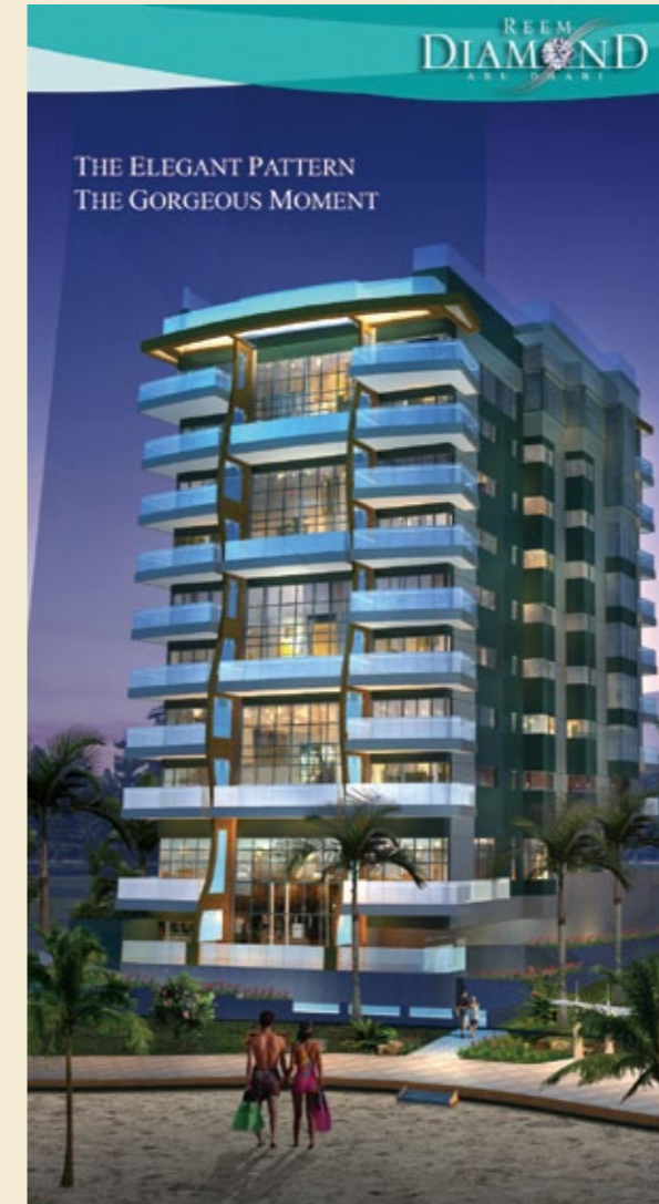
俊和位於阿布扎比的 Reem Diamond 豪宅項目 Reem Diamond, Chun Wo's newly exclusive residential development project in Abu Dhabi

集團積極開拓阿布扎比物業發展市場，位於阿布扎比的低密度豪宅項目 Reem Diamond 早前已完成平頂儀式，即將發售。