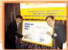
Click and enlarge image

The ERP solution provides prompt analytical evaluations for making directions and decisions.