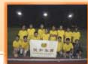
Click and enlarge image

Chun Wo Soccer Team participated in the CITA Football Cup and Corporate Games 2007 to beat with various business and industry counterparts. The Company strives to target employees' work-life balance by organizing staff recreation activities including soccer, basketball, badminton and charity work.