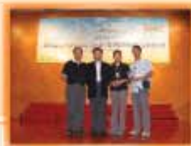
Click and enlarge image

The P307 South Cargo Apron Extension Works and P325 Seawater System Enhancement Works projects won "Zero Work-related Injuries" awards on 9 November 2007.