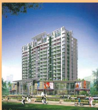
中山俊軒庭 Elite Plaza