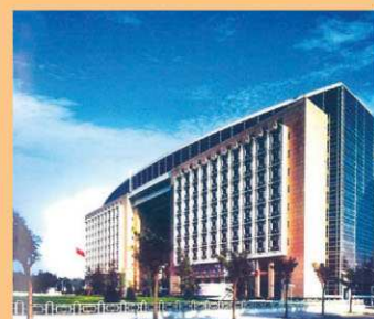
北京國際金融大廈 Beijing International Financial Centre Office Building