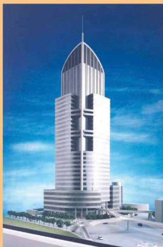
上海港陸廣場 Shanghai Harbour Ring Plaza Office Building

Chun Wo is determined to capture the opportunities in the PRC and secure new lucrative business.